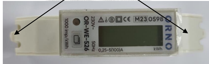
Terminal Cover Sealing Points