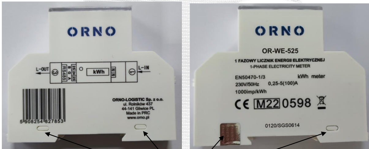
Main Cover Sealing Points